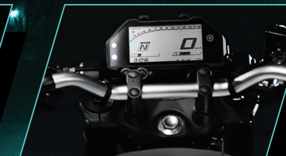
Advanced LCD meter console