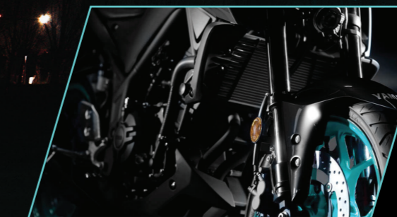
37mm upside down front forks