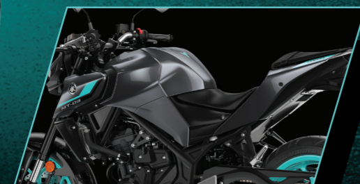
Ergonomic riding position