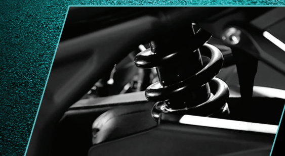
Long swingarm with optimal shock settings