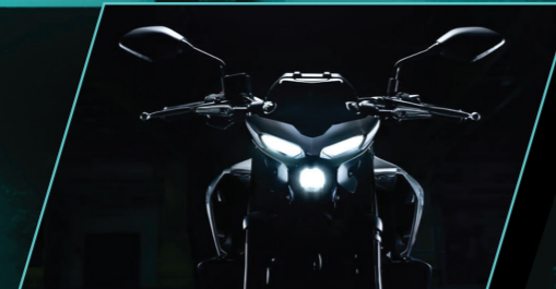
LED headlight with dual eye positions lights