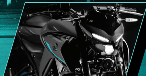
Aggressive & dynamic body design