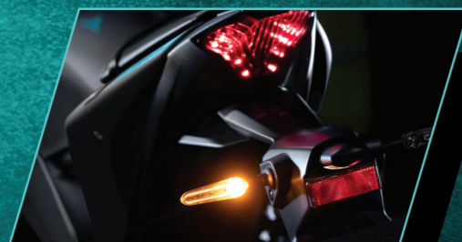
LED flashers - front & rear