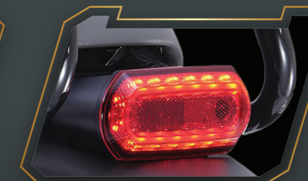
SLEEK LED TAIL LIGHT