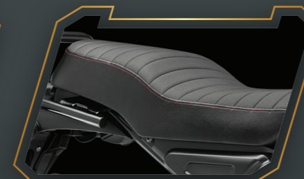
TWO-LEVEL SEAT WITH TUCK AND ROLL