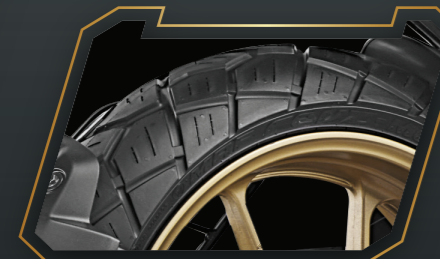
BLOCK PATTERN TYRES