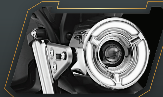
BI-FUNCTIONAL LED HEADLIGHT WITH DRL